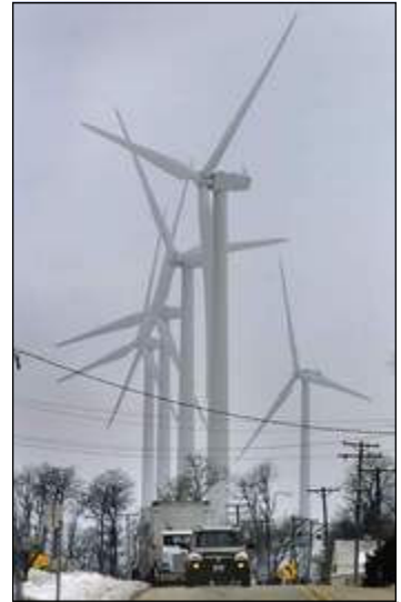
Shabbona wind turbines looking down main st.